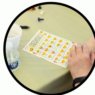
EMOJI Bingo was a big hit. Some described it as 'intense.' Why intense? The great prizes provided by business partners. Thank you partners!