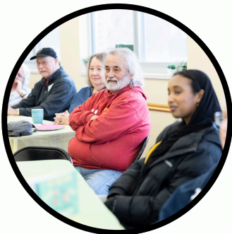
Youth and age united for the cause - Literacy!