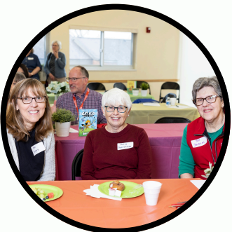
Three strong women who embody ESLC's mission of 'unlocking each child's potential through the power of reading.'