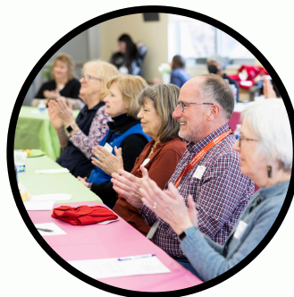
Rounds of applause for the very entertaining and engaging University of St. Thomas Improv class.