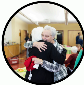
Longtime tutors renew friendships built around a common passion: helping children learn to read